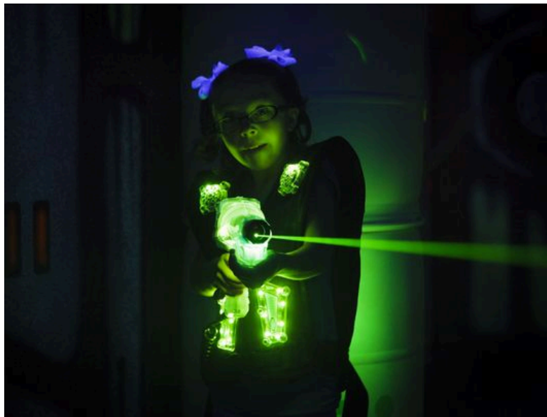
Learn about Laser Tag and how to Play

Laser Tag is a Shooting Game similar to Paintball and Air Soft. The biggest difference between Laser Tag and other Sports, however, is that Laser Tag is Safe and Clean. You'll never have to wear Safety Equipment because Players don't Shoot Pellets or Paint Balls; Instead, Laser Tag uses completely Safe Beams that will never hurt anyone. Not using Pellets or Paint Balls also means that there won't be any Residue or Cleanup involved after Playing.